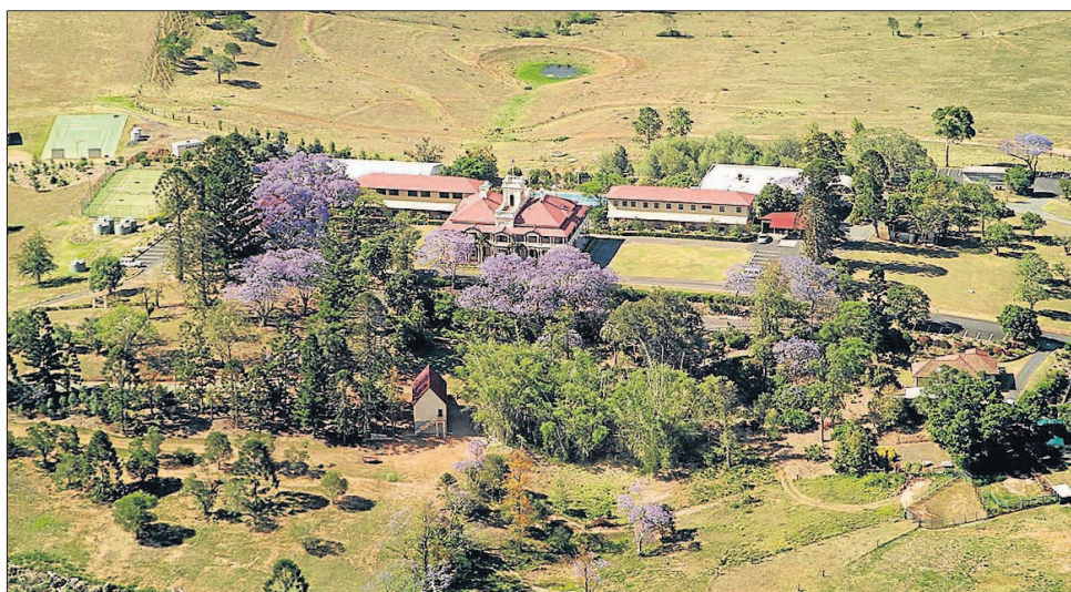
An aerial shot of the Woodlands of Marburg property. The land was bought to relocate a thriving sawmill business in 1870.

There's something special about travelling in one of the oldest flying aircraft and experiencing the same awe our ancestors must have felt as far back as the first successful hot-air balloon flight in 1783.