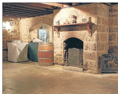
Woodlands of Marburg has a sandstone cellar, which is perfect for intimate functions.

"Many of the German immigrants living in Marburg were very fortunate if they survived the sea journey from