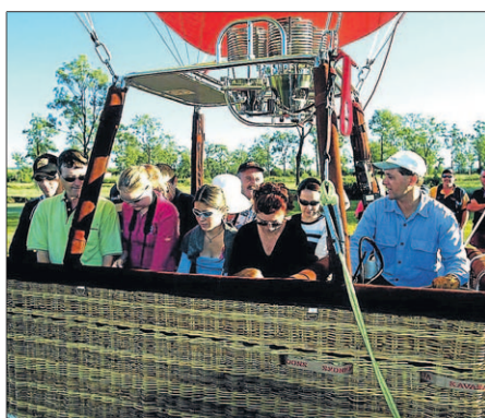
A basket full of flyers prepare to go up, up and away.

It also serves some of the best hand-crafted cocktails I've tasted.