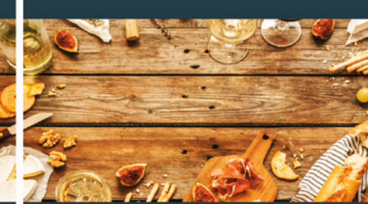
AUGUST & SERTEMBER 2017 | 10AM - 2.30PM

HALF DAY GUIDED TOUR SHOWCASING COWRA WINE REGION