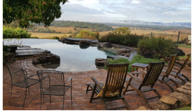
A stay at Spicers Hidden Vale is sure to refresh your spirits and nourish your soul.

in a very funky space with a hip Braddon vibe - and a native bee hotel in the alfresco area. 17 Ellenborough Street. Nourish: A focus on organic, ethically sourced and sustainable produce, Nourish Real Food Café offers healthy alternatives as well as old-fashioned favourites. 160 Brisbane Street: nourishrealfoodcafe.com Colleges by the River: With views across the Brisbane River and riverside parkland at Colleges Crossing, this is a stunning location for a coffee shop with delicious wholesome food to match. Best organic vanilla and turmeric latte ever. 408-492 Mt Crosby Road, Chuwar. Homage: This first class restaurant at Spicers Hidden Vale has a paddock to place philosophy with an emphasis on top quality local produce, much of which is grown on the expansive estate or in the surrounding rich agricultural regions. Executive Chef Ash Martin's 10-hour baked apple dessert was tempting enough to be banished from the Garden of Eden for (except we were right there in paradise); spicersretreats.com